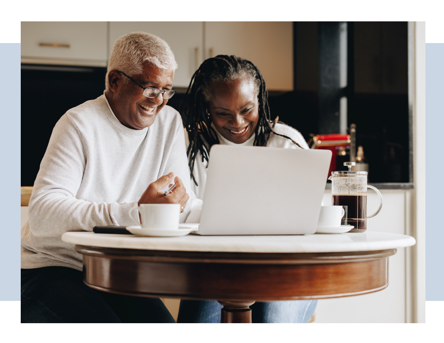
"Your webinars are lovely. Thank you for the encouragement to keep on keeping on. I felt seen and heard and ready for more."

• The number of registered users in the Champion Classrooms increased from 2,780 in 2021 to 3,440 in 2022