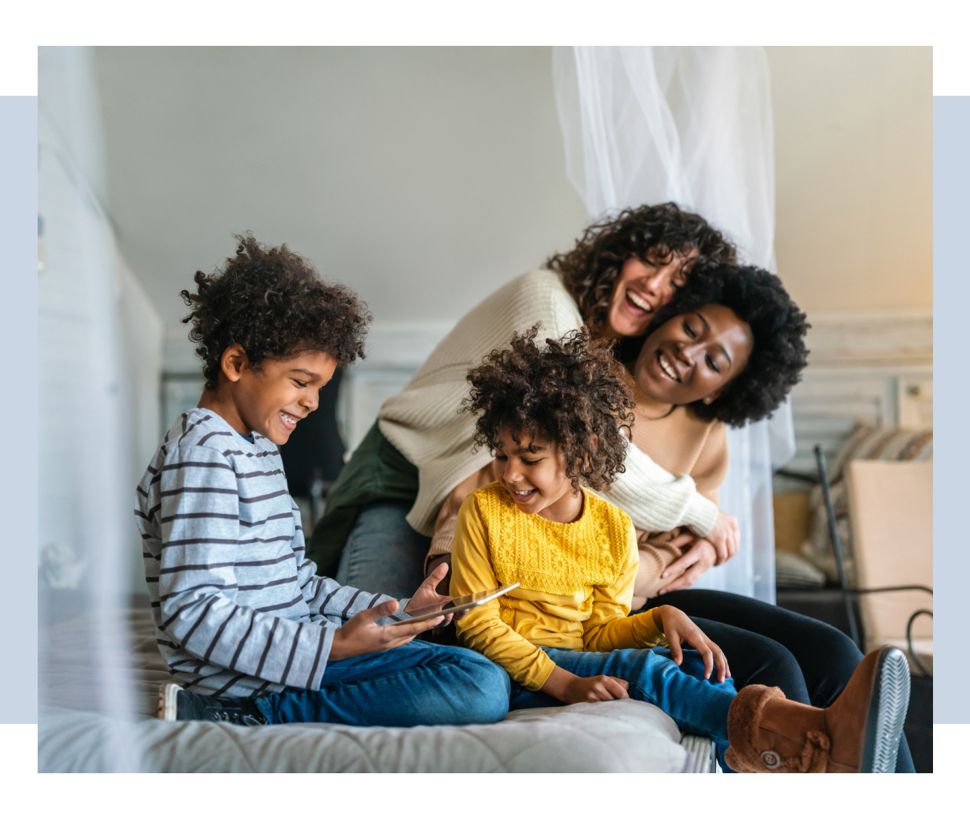
"I was able to take action immediately after getting guidance from the Coalition. Before I called, I wasn't sure what direction to go."